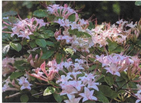
Summer blooming azalea (unnamed Holly Hills Nursery) -20° F

The “rhody” images presented here come from Tom Horner’s “naturalistic” country garden located in south, central Wisconsin town of Waterford). Although the winters can be harsh, Tom’s cultivars, selected for their hardiness, thrive on the naturally-occurring rich, organic soil. Their immense size & majestic blooms are a sight to behold: