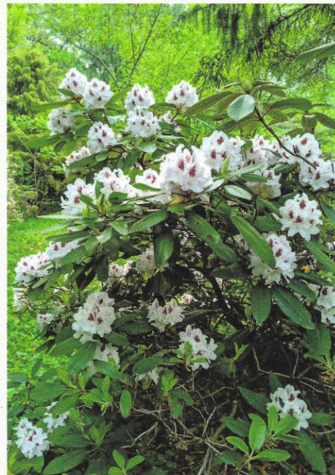
'White Peter' -25° F