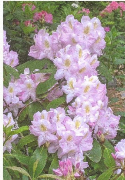
Unnamed Elepidote (from Holly Hills Nursery, Evansville, Indiana) -20° F