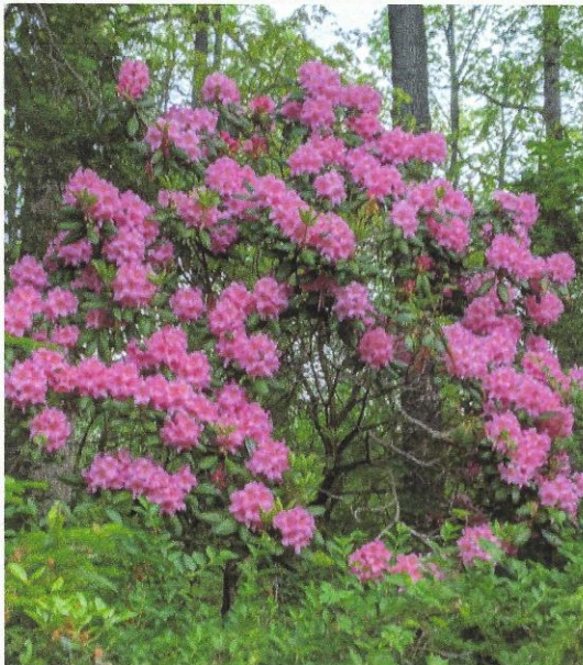
'Wyandanch Pink' -15° F