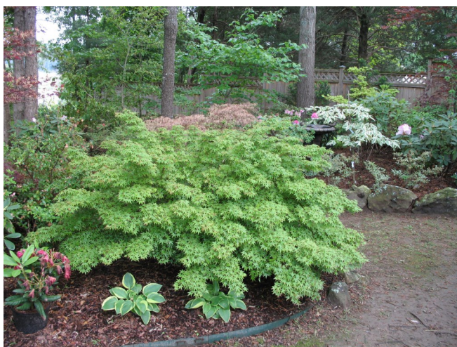
Just one of many Japanese Maples adorning Larry Coleman's garden.