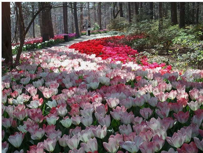
A "raging torrent" of tulips!! GARVAN WOODLAND GARDENS