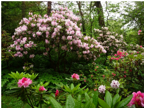
R. 'Caroline' (center background) flanked by R. 'Katherine Dalton' (left foreground) & R. 'Calsap' & 'Campy' (right foreground).