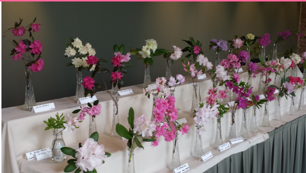
Bud vase display of blooming rhododendrons from Chicago area, Member gardens. (Small leaved rhododendrons predominated.)